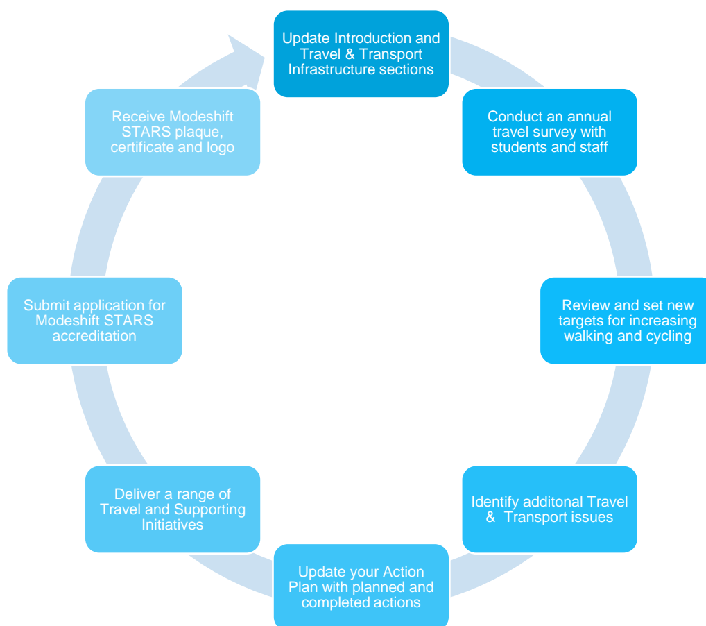
Figure 4 - Modeshift STARS Cycle

Modeshift STARS is a continuous process of planning, doing and reviewing. Each academic year your school has three opportunities to apply for STARS accreditation which fall at the end of each full term. However, SMBC prefer to review STARS accreditation in July, at the end of the school year. The Modeshift STARS Cycle displayed below sets out the process for getting accredited.