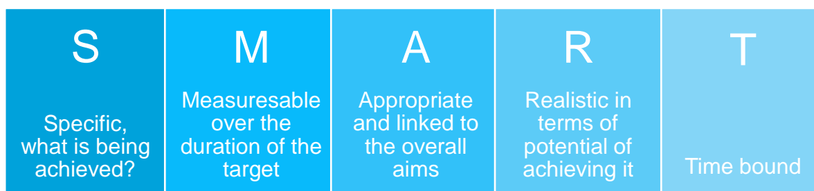
Figure 3 - SMART Targets

The aims and targets should be SMART : Specific, Measurable, Achievable, Realistic and Time Bound.